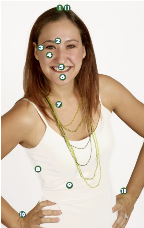
FIGURE 1 THE EFT TAPPING POINTS

This smiling young woman with the dots on her face and body is illustrating the points of EFT.